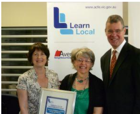
Minister Hall presenting Avenue Neighbourhood House @ Eley with their Round 2 Capacity and Innovation Fund Grant