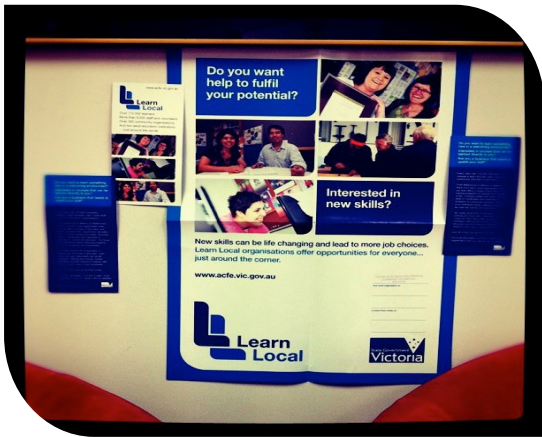
GREAT USE OF LEARN LOCAL POSTERS AND FLIERS – TAKEN AT TRARALGON NEIGHBOURHOOD LEARNING HOUSE