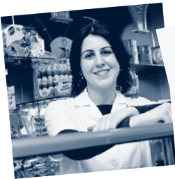
Table 2 summarises the Australian Government Australian Apprenticeships Incentives scheme for all Australian Apprentices (apprentices or trainees). Payment of incentives is subject to employers and their apprentices or trainees satisfying eligibility criteria set out in the Australian Government Australian Apprenticeships Incentives Program Guidelines. Contact your Australian Apprenticeships Centre for further information or go to www.australianapprenticeships.gov.au/Info_Emps/Incentives.asp