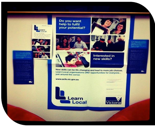
GREAT USE OF LEARN LOCAL POSTERS AND FLIERS – TAKEN AT TRARALGON NEIGHBOURHOOD LEARNING HOUSE